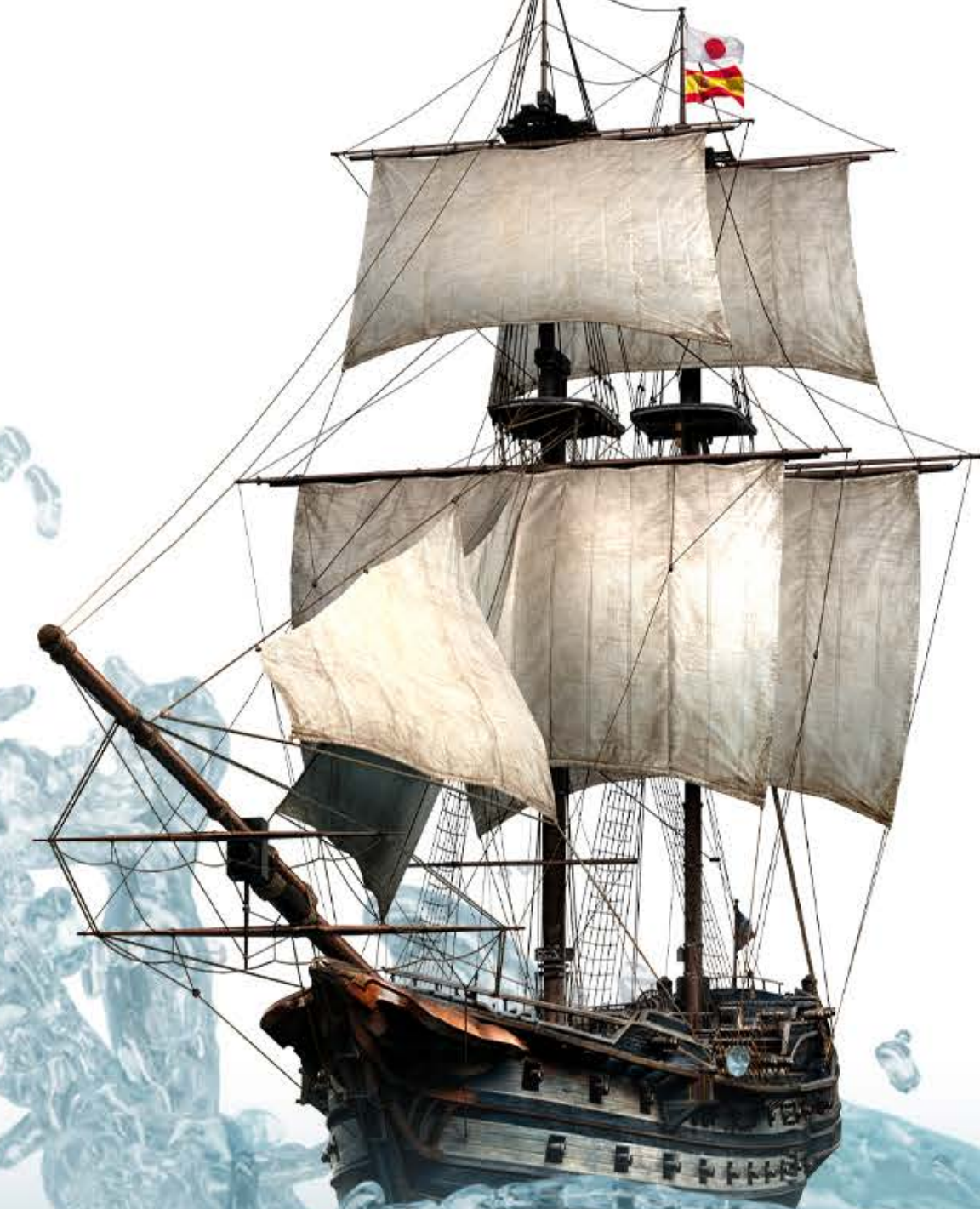
DATE MARU GALLEON FROM THE KEICHO EMBASSY