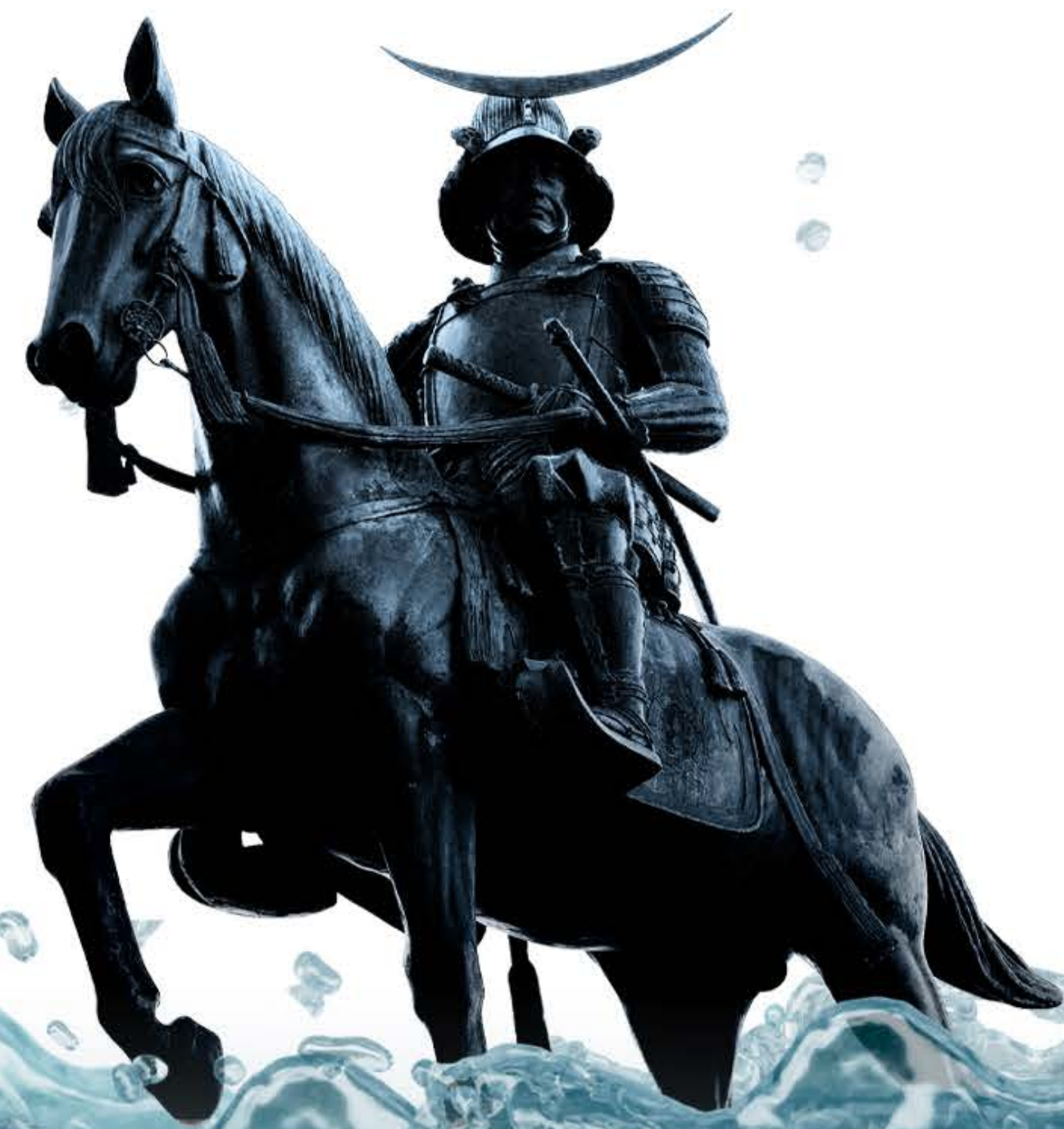
DATE MASAMUNE (1567-1636)